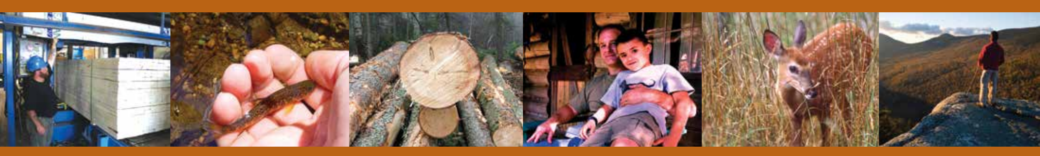
That a resource of such extraordinary value and national significance remains intact is a testament to those who have owned and stewarded these lands for generations.